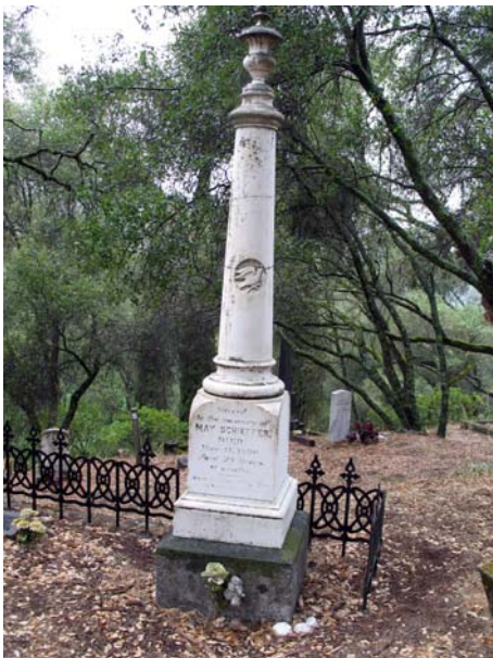
The Burgundy Lady could look like the photo above. These tombstones are in the Schieffer Family plot area.