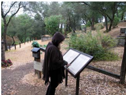
Vickie C. looking over the map of the Pioneer Cemetery and the list of names who are buried there.