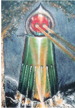
The Flatwoods Monster

Virginia that has huge wings, glowing eyes, no head. Other winged humanoids have been seen in places like Vietnam and the British Isles.