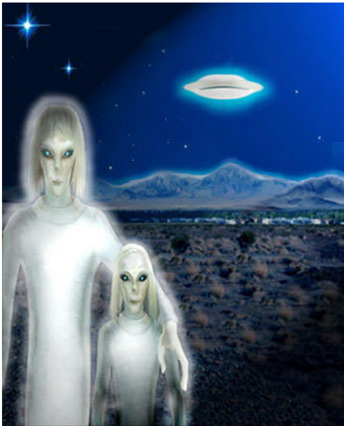
The Tall Whites

Many countries and cultures describe their own type of aliens. Perhaps aliens section certain areas of Earth as their own, making claim to certain territories of Earth. For an example you have the Ikals. These are dark, hairy humanoids that have been related in Mexican folklore from the Tzeltal people. They are described as three feet tall and are associated with a luminous flying object. They are also famed for their abductions of humans and have the capabilities of paralyzing humans.