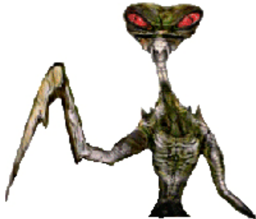
Mantis type alien